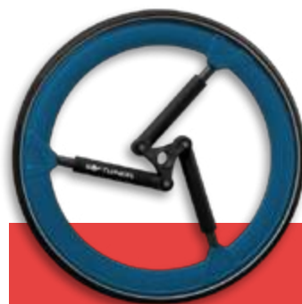
360° Degrees Suspension™