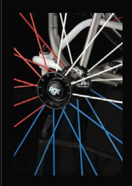
Our Contact Info:

We have asked Spinergy to consider testing the wheels, in particular the SLX 24 Spoke wheel to 500 pounds being the bariatric testing weight.